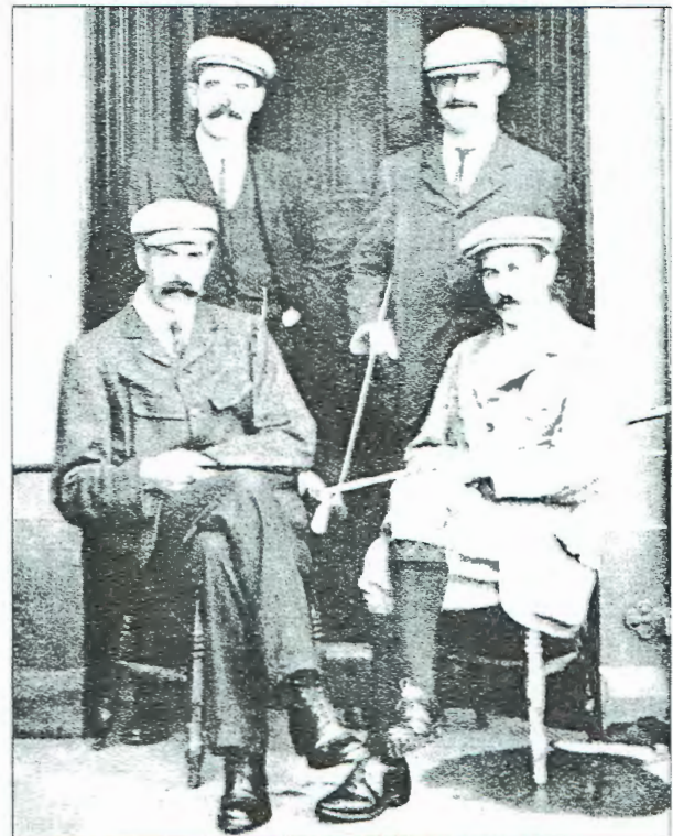
Back: Herd & Taylor; Front: Braid & Vardon

Playing four ball 'better ball' Scotland led by four holes in the first round increasing by five holes in the second, and eventually won the match by nine holes with seven to play. The individual scores were Vardon 76/74; Taylor 80/80; Herd 78/74; Braid 73/81. On the following day the Glasgow Herald , Daily Record , Daily Mail and the Glasgow Evening News all carried full reports of a memorable day – now in our archives.